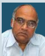
Dr. S. Sivaram

Figure 1: A typical organic solvent nanofiltration plant.